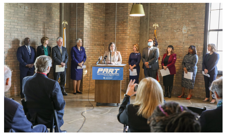
Regional leaders gather to deliver the Plan of Action for Regional Transit

Learn more at <a href="mailto:cmap.is/PART">cmap.is/PART</a>