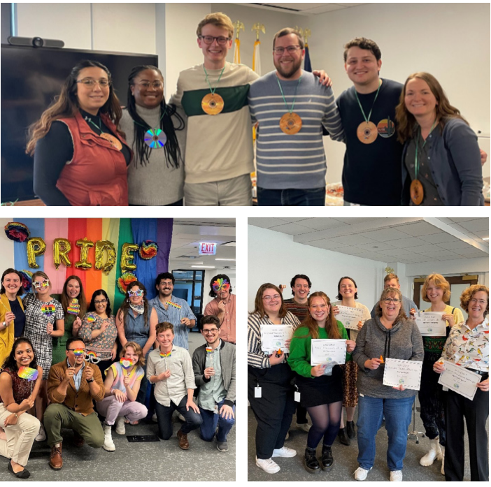
CMAP team members celebrating together

Finally in 2023, WeIMAP — our internal committee focused on fostering a more inclusive workplace hosted several events to promote a social culture and consistently draw strong staff participation, including the Winter Games, Public Service Recognition Awards, Take Your Children to Work Day, Pride celebrations, and more.