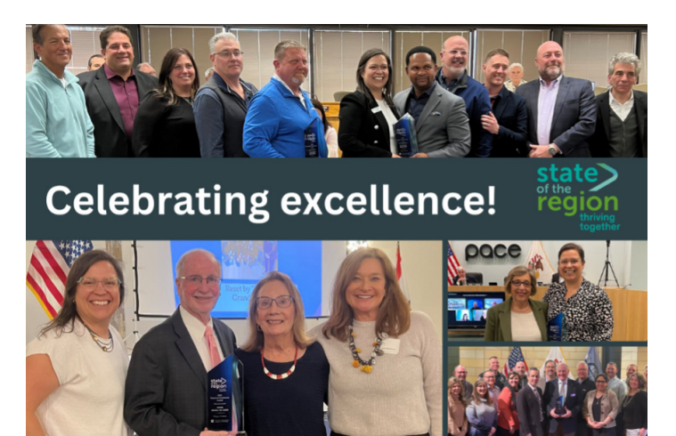
Handing out Regional Excellence Awards to our 2023 winners

Through their projects and careers, the award winners have helped prioritize equity, strengthen resiliency, and make the region's communities more economically competitive. The winners were selected by a jury of local government officials, advocates, and students.