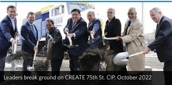
Leaders break ground on CREATE 75th St. CIP, October 2022

Northeastern Illinois is the preeminent freight hub in North America. A quarter of all freight in the nation originates, terminates, or passes through metropolitan Chicago, which is home to six of the seven Class I railroads, ten interstate highways, O'Hare Airport - one of the world's busiest cargo airports, and the only connection between the Great Lakes and Mississippi River systems. Investments in this region's rail has local, regional, and national impacts and advances federal safety, climate, and Justice40 goals. Regional partners prioritized 47 crossings for grade separations or other improvements, including these priority projects: